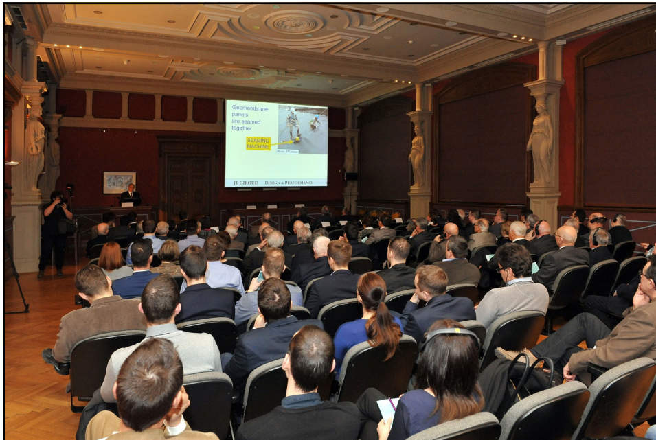
Attendees and a typical slide