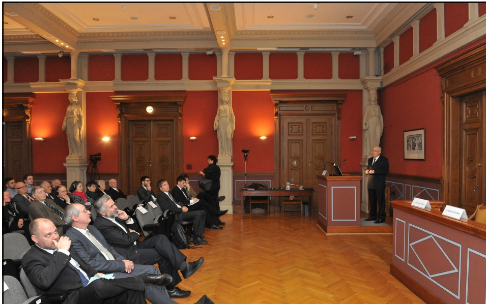
The impressive setting of the Great Hall of the Hungarian Academy of Sciences