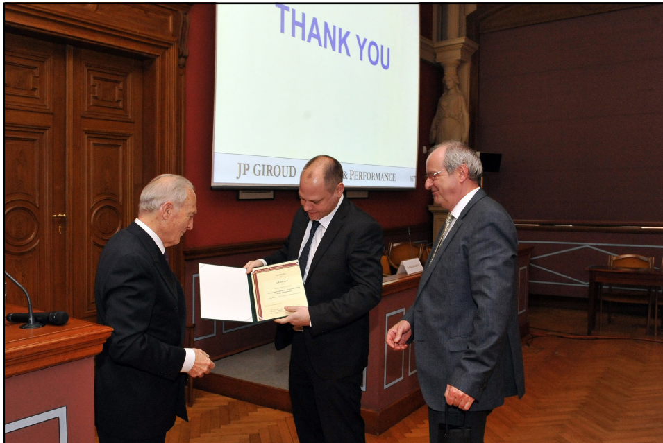
Thank you time at the end of the lecture