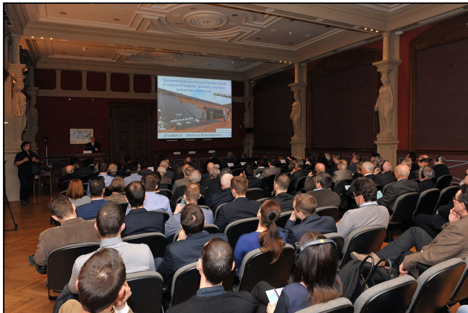
Attendees and a typical slide