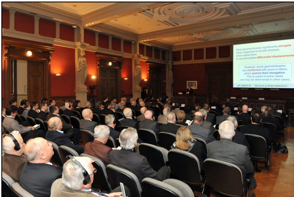
Attendees and a typical slide